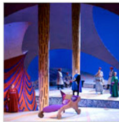
Visualizing the Depths of Wagner's 'Tristan'