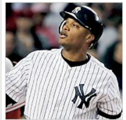
Rhoden: Problem Is Selig's to Solve

Home | World | U.S. | N.Y. / Region | Business | Technology | Science | Health | Sports | Opinion | Arts | Style | Travel | Jobs | Real Estate | Automobiles | Back to Top