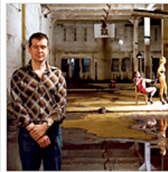
The Business of Online Pornography